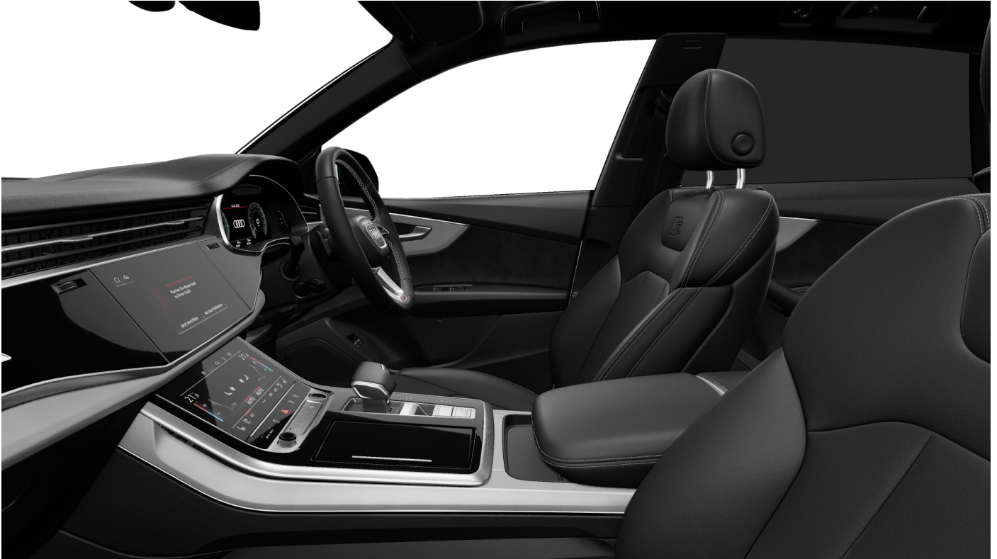
Black/Black Leather Interior (Option Code EI)