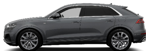
Daytona Grey 6Y6Y Pearl Effect €1,375