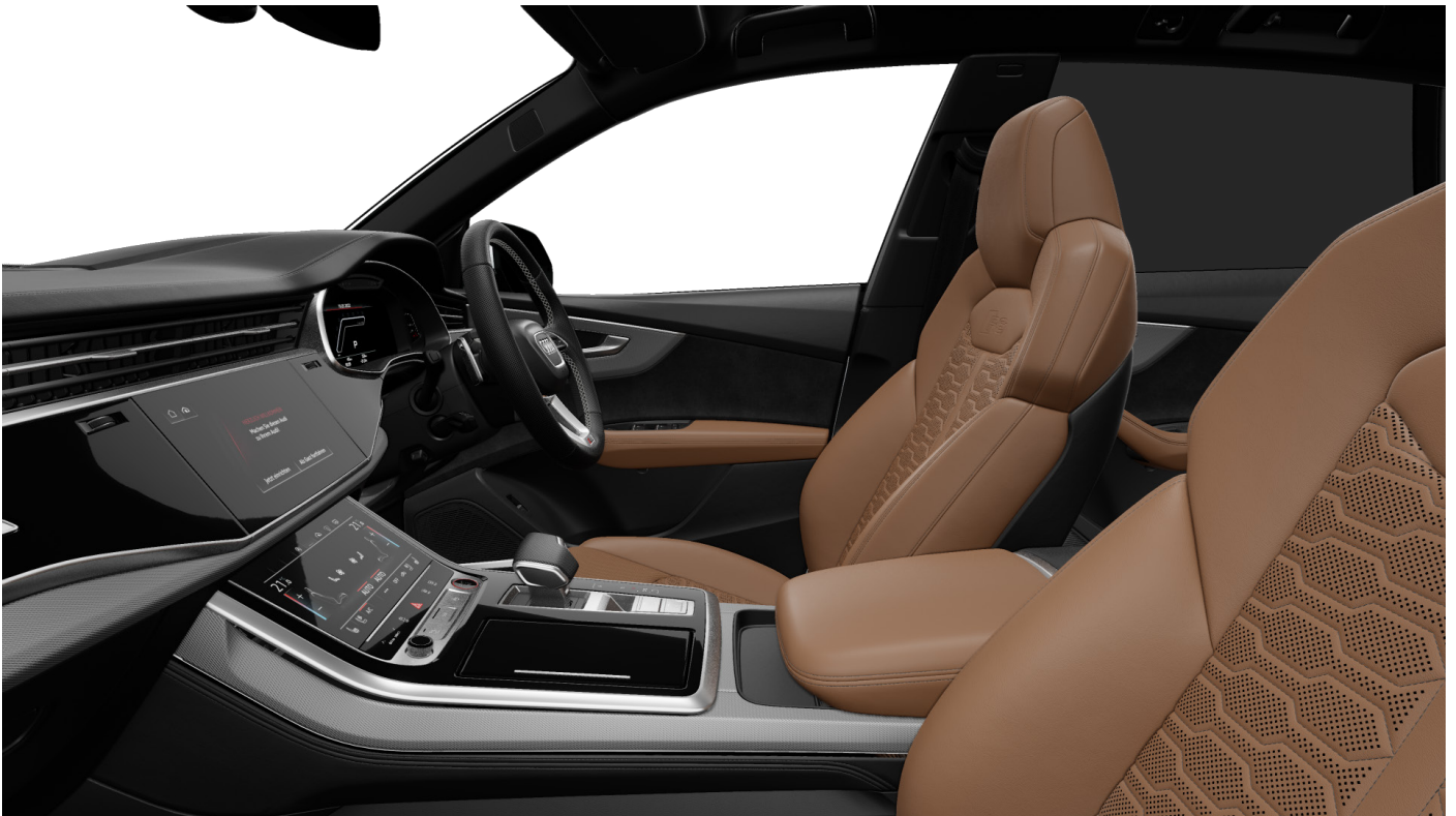
Cognac Brown-Granite Grey/Black Leather Interior (Option Code QN)