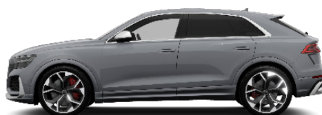
Nardo Grey T3T3 2 Solid €0