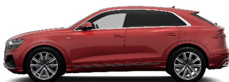
Matador Red T7T7 Metallic €1,375