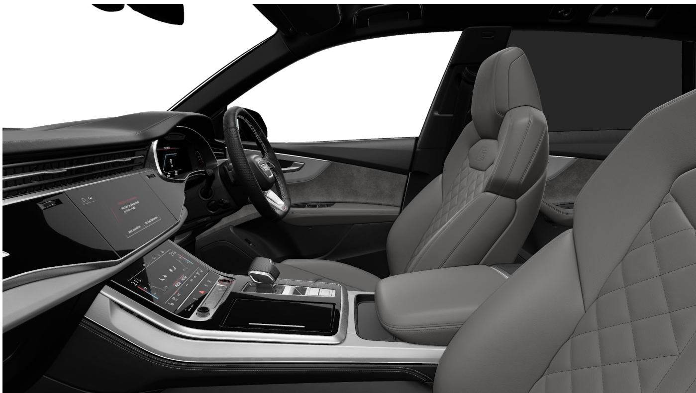
Rotor Grey/Black Leather Interior (Option Code OQ)