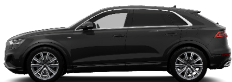
Mythos Black 0E0E Metallic €1,375