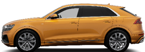
Dragon Orange Y4Y4 Metallic €1,375