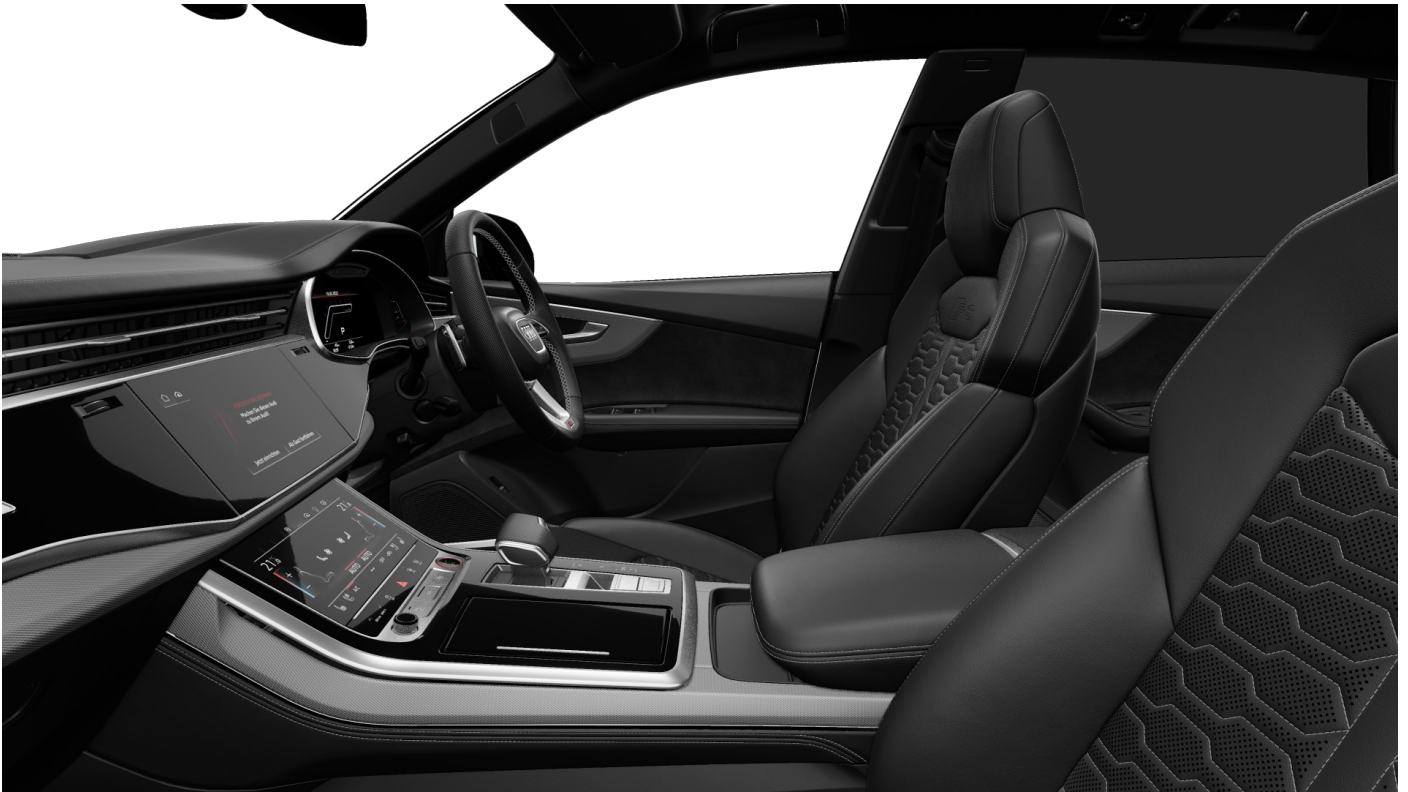
Black-Rock Grey/Black Leather Interior (Option Code UB)