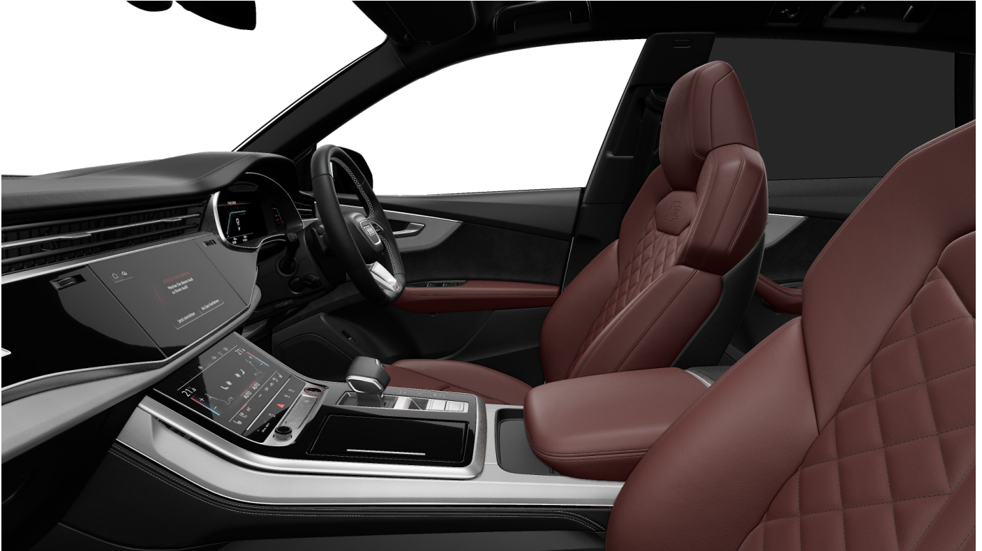
Arras Red/Black Leather Interior (Option Code XU)