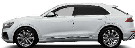
Glacier White 2Y2Y Metallic €1,375