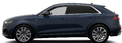
Waitomo Blue D6D6 1 Metallic €1,375