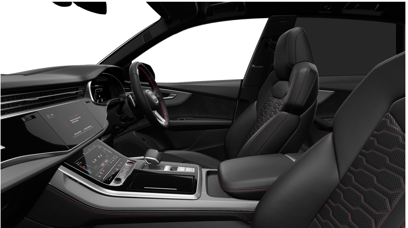
Black-Express Red/Black Leather Interior (Option Code AR)