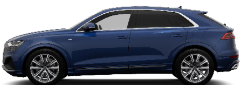
Navarra Blue 2D2D Metallic €1,375